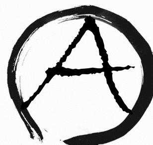
An A inside a circle is the traditional symbol for anarchy.

In an anarchy , nobody is in control—or everyone is, depending on how you look at it. Sometimes the word anarchy is used to refer to an out-of-control mob. When it comes to government, anarchy would be one way to describe the human state of existence before any governments developed. It would be similar to the way animals live in the wild, with everyone looking out for themselves. Today, people who call themselves anarchists usually believe that people should be allowed to freely associate together without being subject to any nation or government. There are no countries that have anarchy as their form of government.