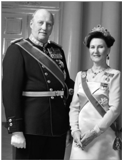
King Harald V of Norway with his wife, Queen Sonja. Norway is a constitutional monarchy. The king is the head of state and has a mainly ceremonial role. The actual government is a democracy.