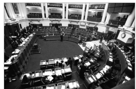
The Peruvian legislature