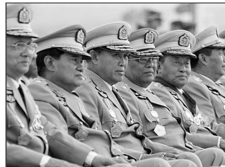
From 1962 to 2011, Myanmar (also known as Burma) was ruled by a military junta that was condemned by the world for its human rights violations.

In an oligarchy (OH-lih-gar-kee), a small group of people has all the power. Oligarchy is a Greek word that means “rule by a few.” Sometimes this means that only a certain group has political rights, such as members of one political party, one social class, or one race. For example, in some societies only noble families who owned land could participate in politics. An oligarchy can also mean that a few people control the country. For example, a junta is a small group of people—usually military officers—who rule a country after taking it over by force. A junta often operates much like a dictatorship, except that several people share power.