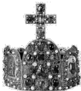
Crown of the Holy Roman Empire, which was tied to the Catholic church and lasted from the 10th—19th century.