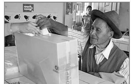
A man votes in Peru.

In a direct democracy , there are no representatives. Citizens are directly involved in the day-to-day work of governing the country. Citizens might be required to participate in lawmaking or act as judges, for example. The best example of this was in the ancient Greek city-state called Athens. Most modern countries are too large for a direct democracy to work.